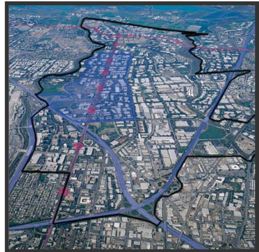
North San Jose – Aerial View

The North San Jose Area Development Policy provides an additional 26.7 million square feet of R&D/office development capacity which could generate over 83,000 jobs. The policy also provides 32,000 high-density residential units and 1.7 million square feet of retail space, parks and open space.